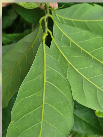
不平衡葉基 asymmetrical leaf base